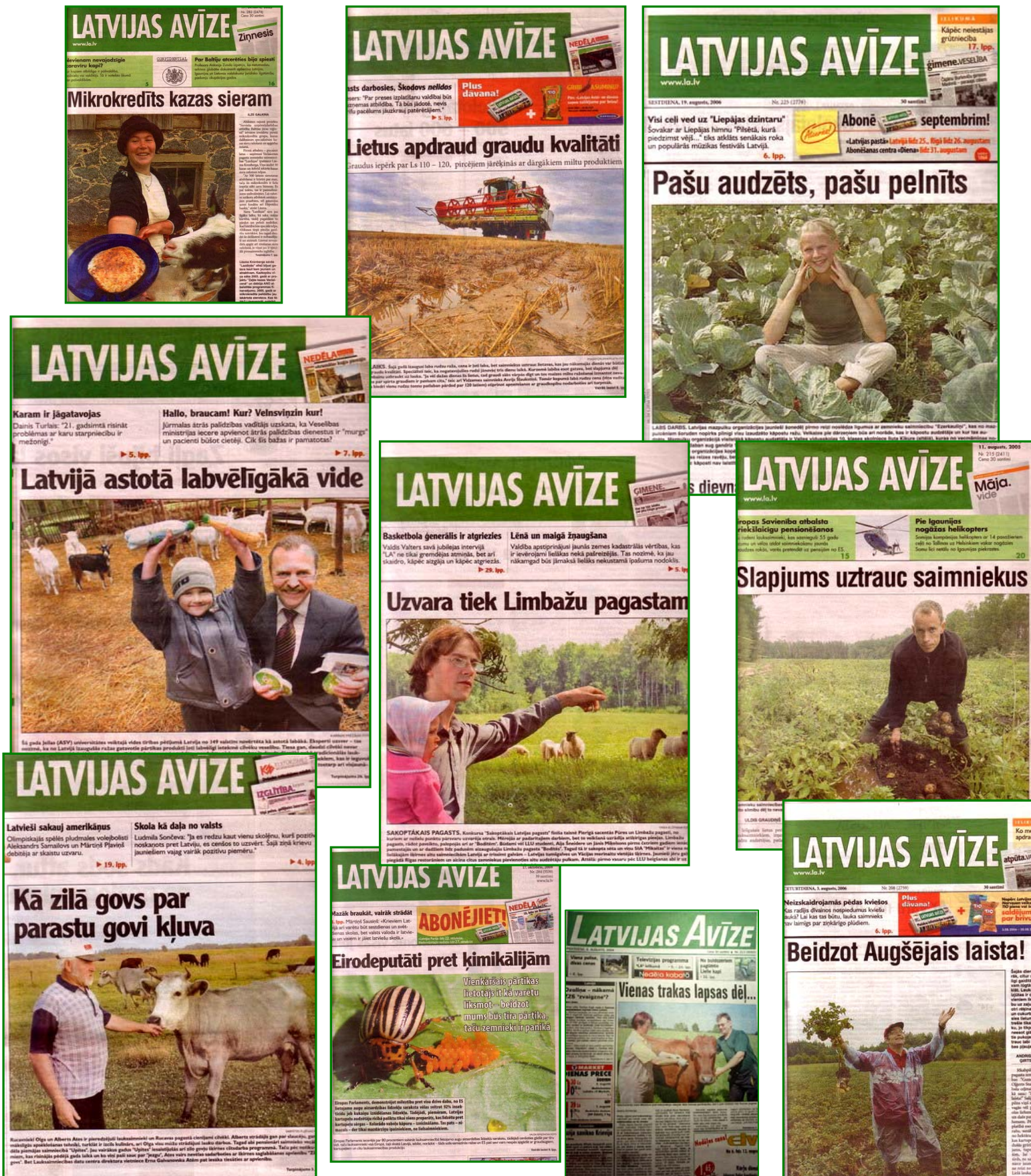
Image 1. Some examples of “Latvijas Avīze” covers representing countryside and agriculture (2004–2008)