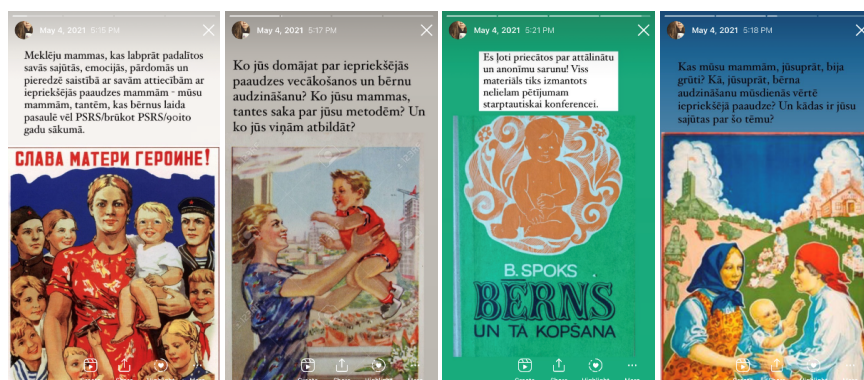
Figure 1. Open call for volunteers on Instagram.

First of all, a call for volunteers to participate in a study about the feelings, everyday life and views on motherhood was posted in the author’s personal social media profile on Instagram . The post ( Instagram Story ) contained information about the core theme of the study (motherhood and comparison regarding childrearing methods in Soviet Latvia and contemporary Latvia) (Figure 1). The call was addressed to mothers, not specifying the age or number of children. Eight mothers replied and showed initiative to participate in the study and all were included in the sample.